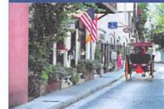
Historic St. George St