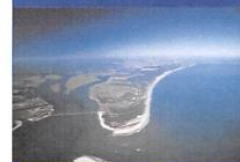
Aerial view of Amelia Island

Departure: Bristol Township Center, 2501 Bath Rd, Bristol, PA @ 8 am