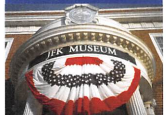
Visit to the JFK Museum