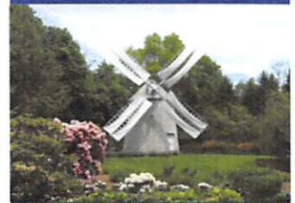
One of Cape Cod's many Windmills