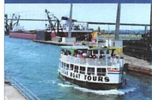
Soo Locks Cruise in Sault Sainte Marie