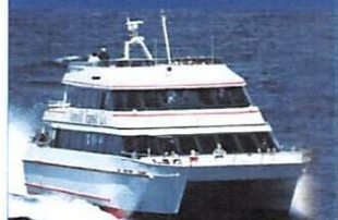
Mackinac Island Ferry

Departure: Bristol Township Center, 1501 Bath Rd, Bristol, PA @ 8 am