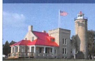
Mackinac Point Lighthouse