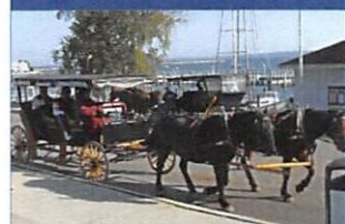
Tour Mackinac Island by Horse and Carriage