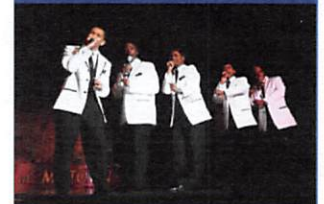
SOUL OF MOTOWN